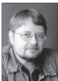
Luis Alberto Urrea author, The Devil's Highway

"Each year we have a selection committee that consists of faculty, staff and student members of our campus community that participate in the selection process. The entire campus community is invited to suggest books for the CCBP, and each year the committee reads